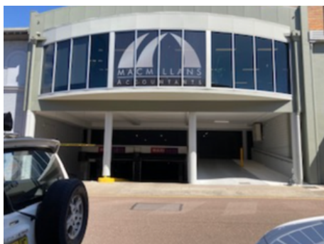
BUILDING CARPARK (TO THE LEFT OF THE ENTRY). TO ACCESS THE ENTRY, YOU NEED TO WALK BACK UP THE DRIVEWAY NOT THE RAMP INSIDE OF THE CARPARK.