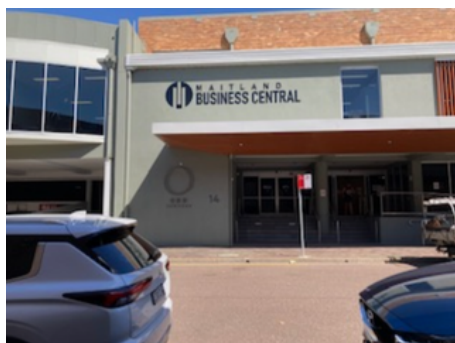
BUILDING ENTRY. STAIR OR RAMP ACCESS.

📍 MAITLAND BUSINESS CENTRE SUITE 12/ LEVEL 1, 14 BULWER STREET MAITLAND NSW 2320